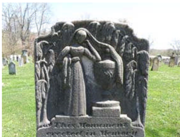
Our 2010 Conference Logo

from the gravestone of Mr. Byron Hayes who died March 6, 1836. It is located in Granville's Old Colony Burying Ground, established in 1805.